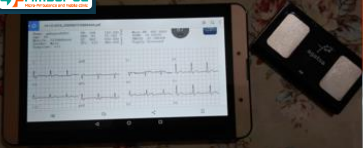
12 lead ECG Machine