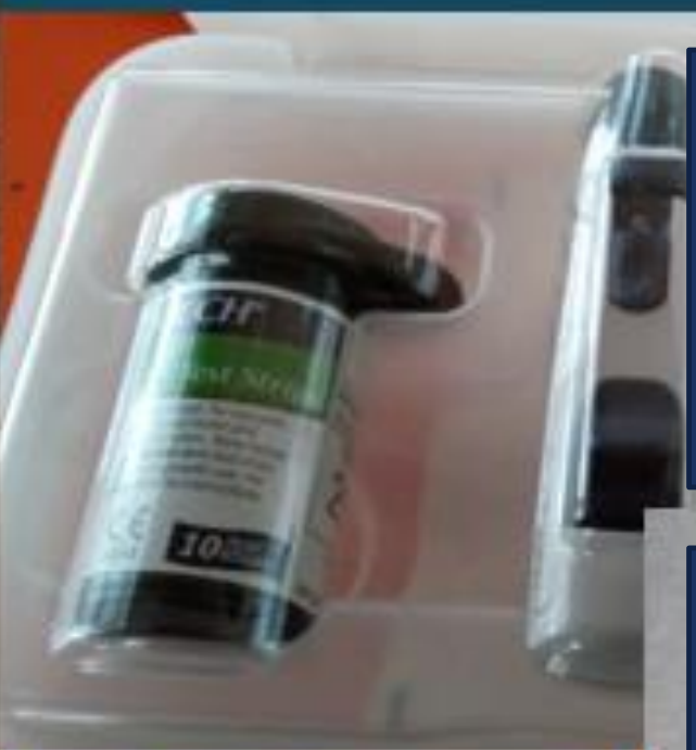
Glucometer, Hb Strips, Dengue*, malaria* Other tests